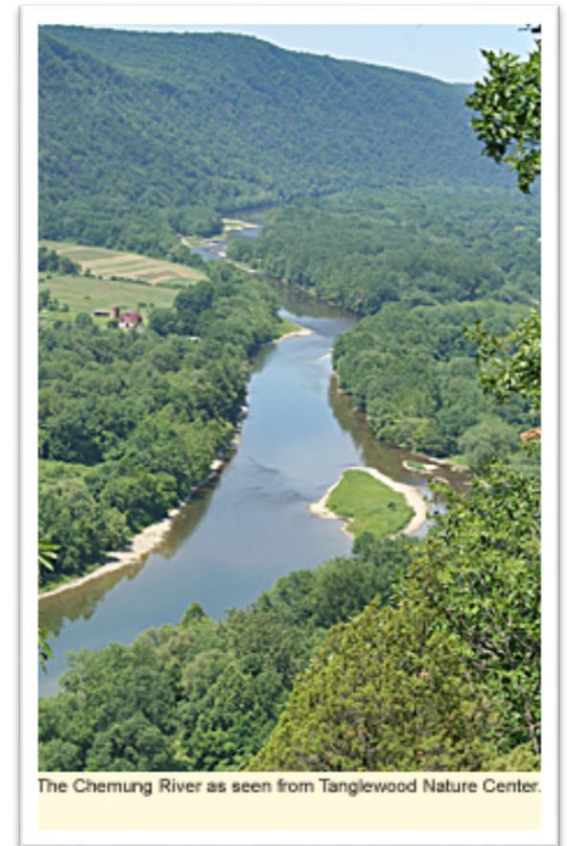
The Chemung River as seen from Tanglewood Nature Center.

Tanglewood Nature Center 443 Coleman Avenue Elmira NY 14903